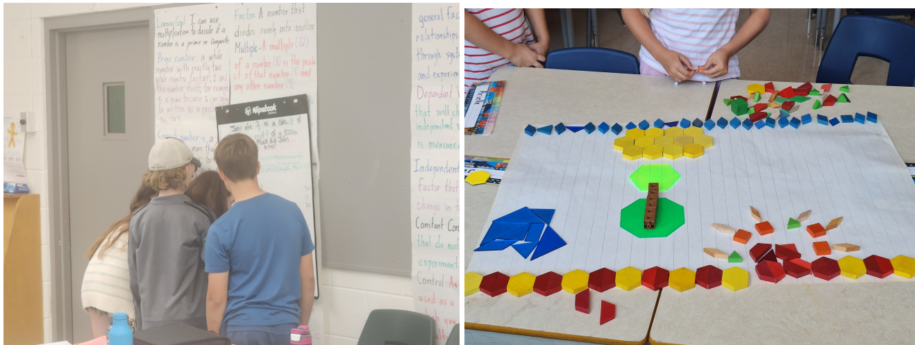
Consolidating Mathematical Thinking with collaboration using patterns blocks and vertical non-permanent surfaces.