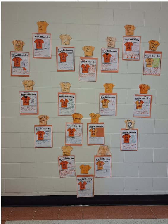
Every Child Matters - Orange Shirt Day Activity.