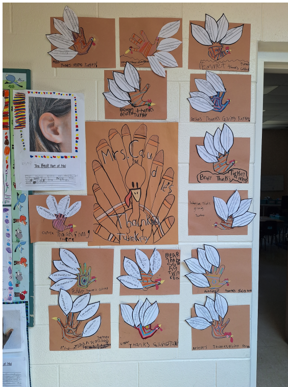
Thankful Turkeys - I am thankful for Mother Nature.