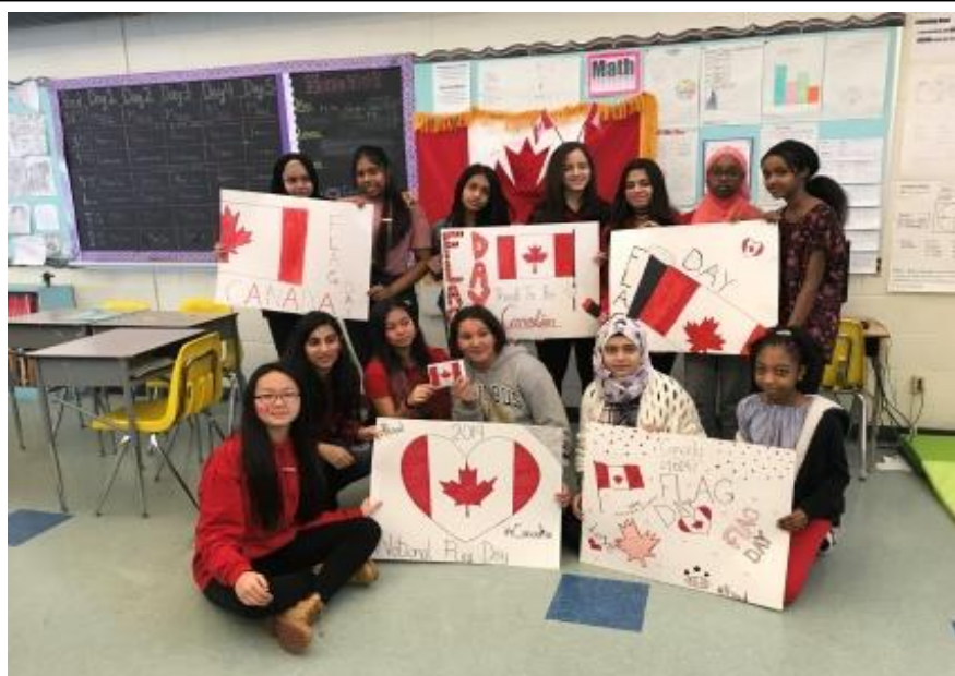
Islington recognizes Flag Day and uses a critical lens to answer "What Does it Mean to You?"