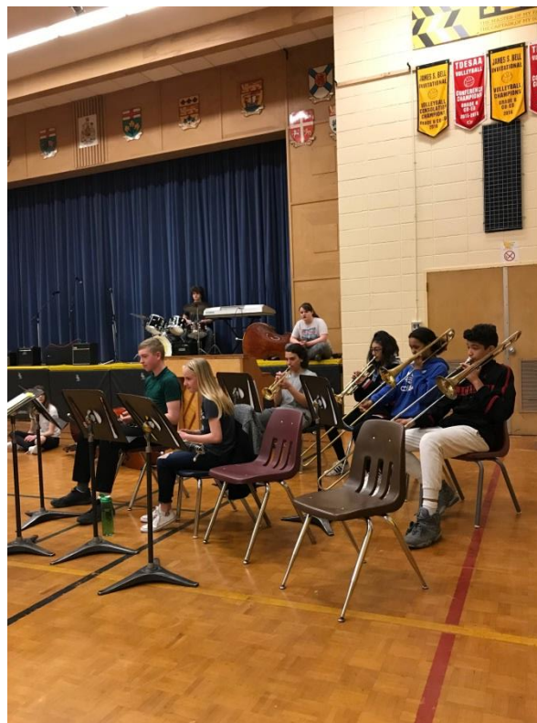
Strings and Band performing at our April Terrific Tigers Assembly