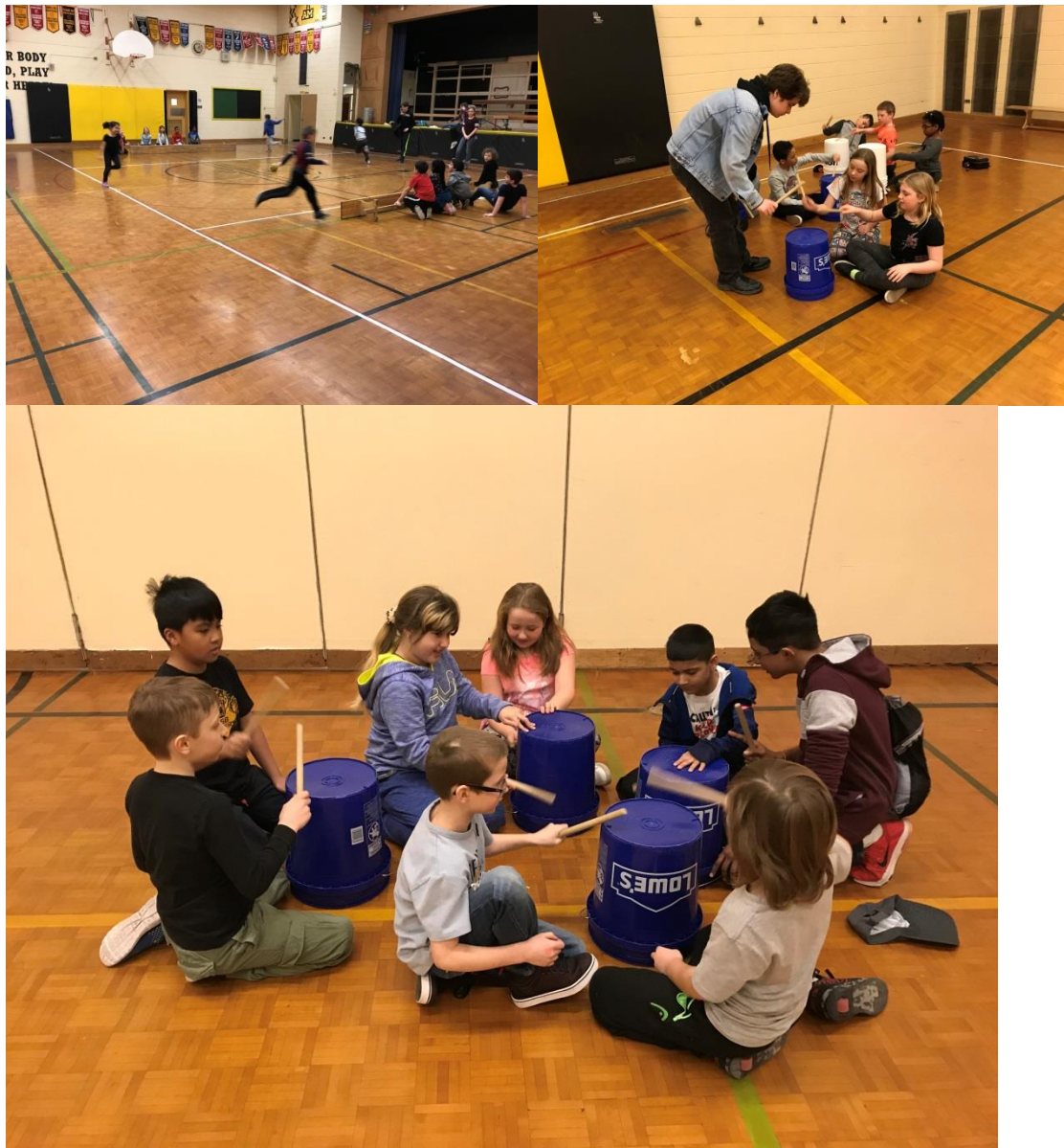
Bench-ball and Percussion!