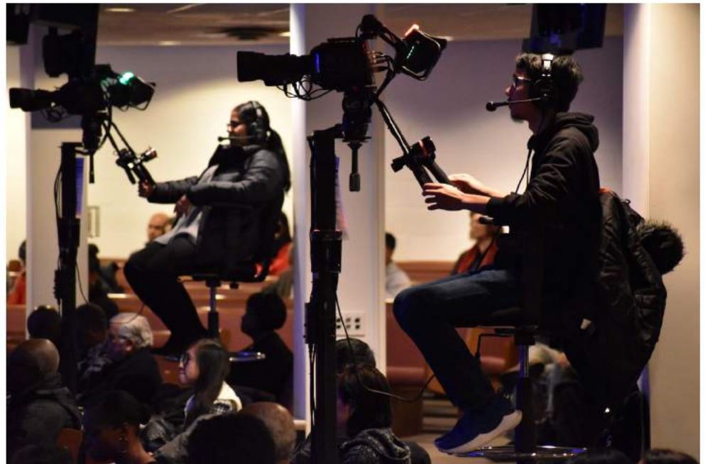
Camera operating summer job