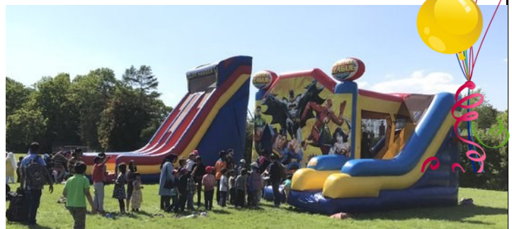
(June 10, 2019)