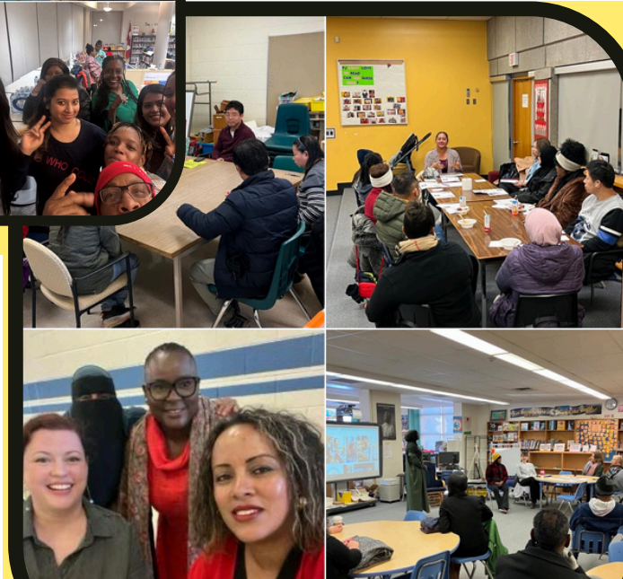
Early years Literacy and Numeracy