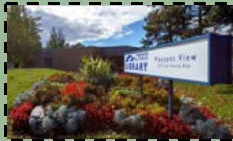
Visiting the Library