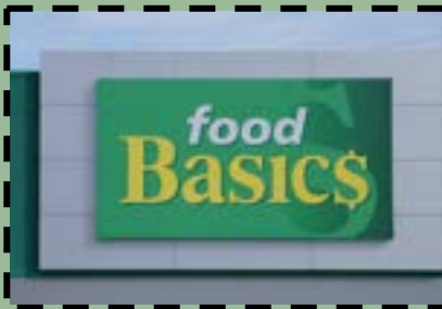
Visiting Food Basics