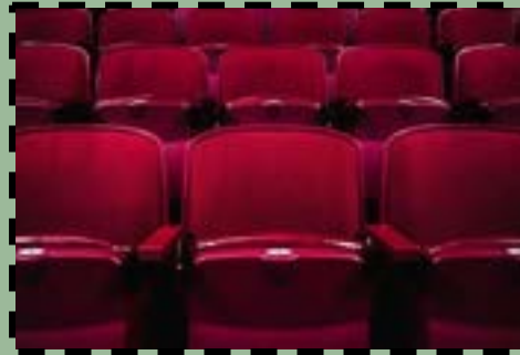
Girls Club Trip to the Movies