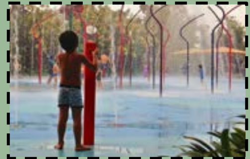
Trips to Splash Pad