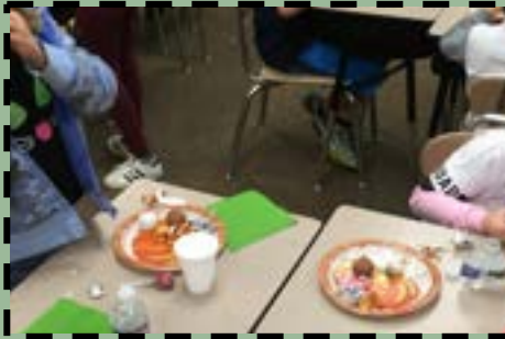
End of Year Parties