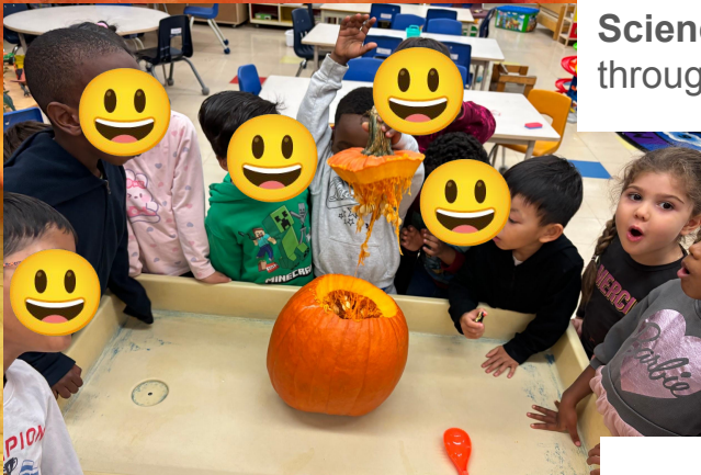
Science Inquiry: Exploring all our senses through a pumpkin sensory experience.