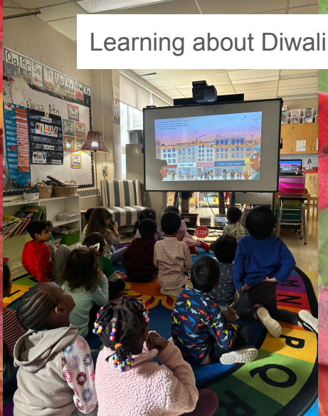
Learning about Diwali