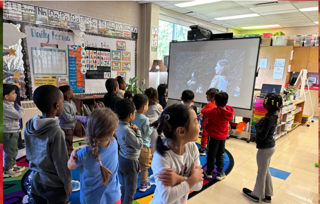
Practicing Mental Mindfulness: I AM YOGA