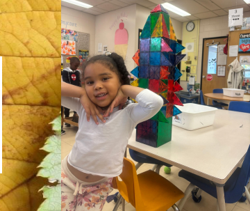
KA's October Focus Math: Patterning & Sorting Literacy: Stretching Words