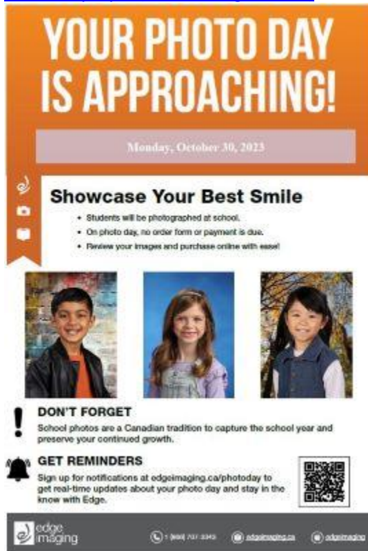
Photo Day - Monday, October 30th Photo Day Flyer (PDF of image below)

Sending this late as I wanted to include information about Photo Day!