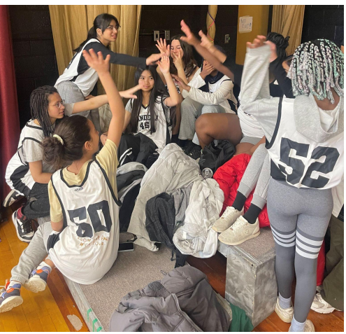
Junior Girls Volleyball Tournament