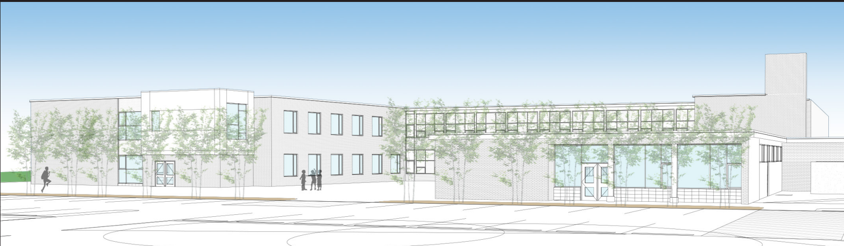
view of addition and renovation area from parking lot