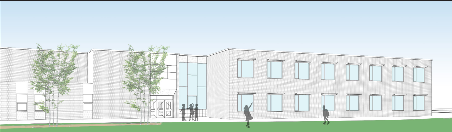
view of addition from playground