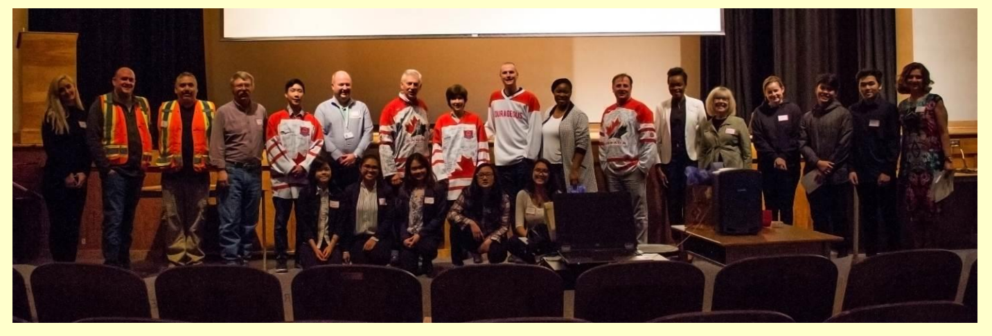
Stronger . . . Together, we can inspire every Canadian student to have the courage to oppose unsafe work!