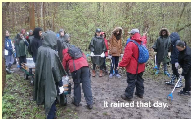
It rained that day.

Finally, the Grade 10 Visual Art class continued the tradition of the annual spring environmental clean up and plein air painting at Forest Valley Outdoor Education Centre .