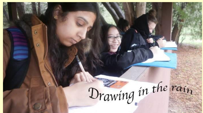
Drawing in the rain