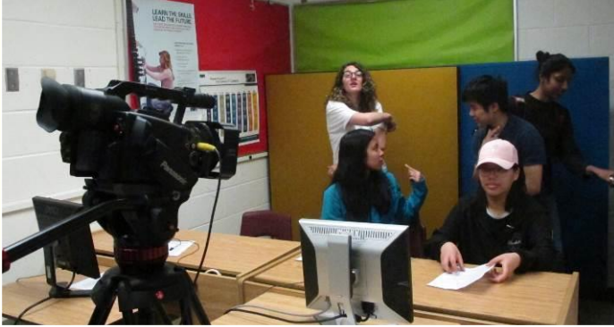
In grade 12 Communications Technology, the students broadcast the morning announcements throughout the school.