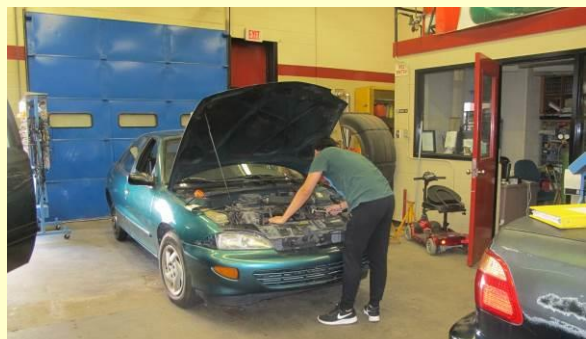
A transportation student problem solving the fuel injection and ignition systems in Northview's auto shop.