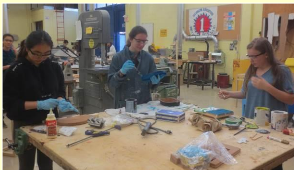
Grade 9 exploring technology students working on their clocks.