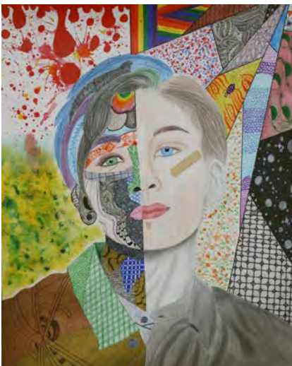
Large mixed media portraits, pencil, watercolour, gel pens, markers, acrylic paint, ink, colour pencils, paint pens and a band aid.

Very soon we will be recognizing the class of 2018 at the Cyber Grad and Art Show. Students in all grades are working hard to make this an evening to remember.