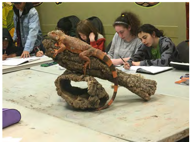
Students getting up close at Reptillia