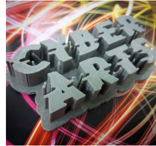
Student designed CyberARTS logo and 3D print

This semester, students are working in a variety of digital and traditional media including optical illusions, website building, logo creation and large mixed-media portraits. The grade 9 CyberARTS students also had a tour of Canada's largest reptile zoo and got up close to sketch and learn about the animals.