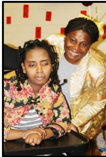
Students prepared sensory books and role play to highlighting different folktales ↓