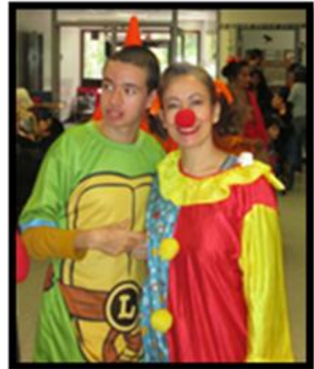
Winning Student Costume!