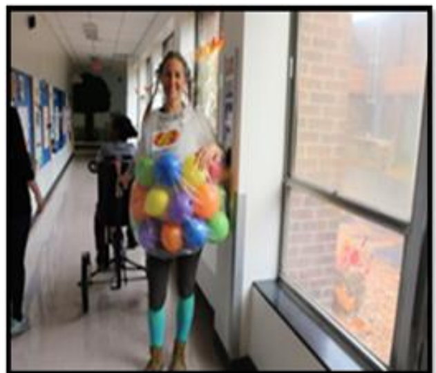
Winning Staff Costume!