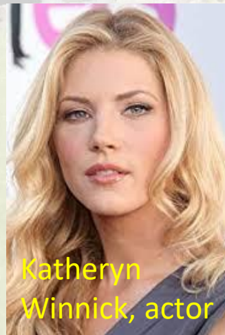
Katheryn Winnick, actor