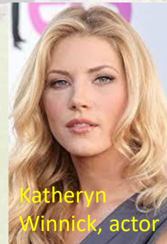
Katheryn Winnick, actor