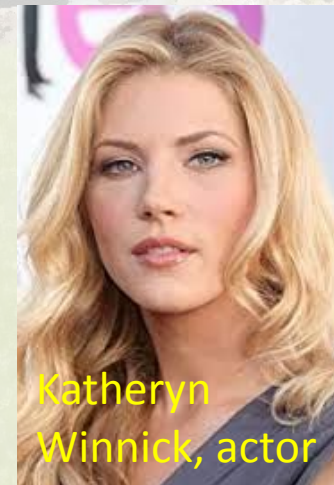
Katheryn Winnick, actor