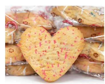
Fudge Chip DeLite *