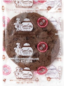
Fudge Chip DeLite *