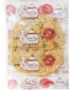
Fudge Chip DeLite* Vanilla Butterfly (Mar-Mav)