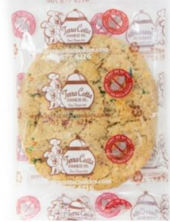
Fudge Chip DeLite *