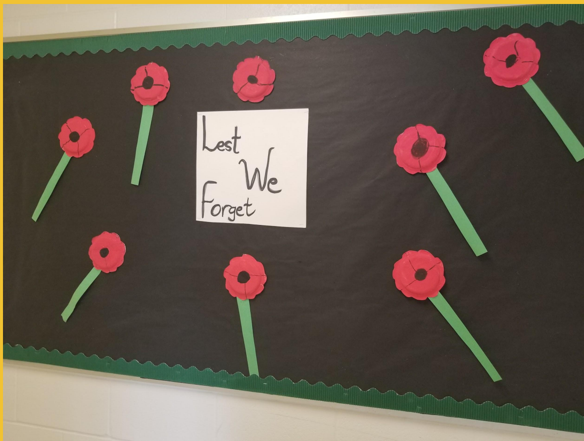
Poppies created by students in Room 105