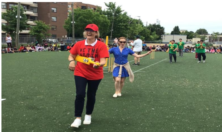
Staff vs Student Cricket Match