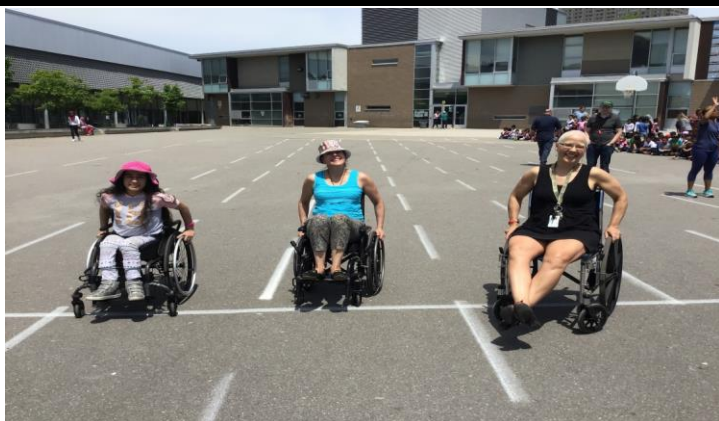
Track & Field