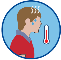
Fever > 37.8°C