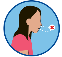
Loss of taste or smell

If "YES": Stay home, self-isolate & get tested or contact your child's health care provider.