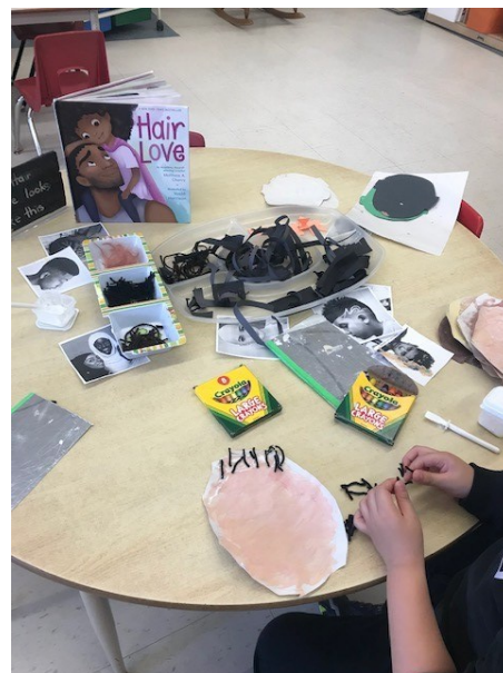
Using picture books to learn and talk about our individual identities.