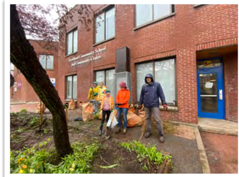
Photo above: Gardening Club meets on Tuesdays and Wednesdays, even in the rain! Thank you volunteers!

Frankland's Gardening Club has been diligently meeting and putting green thumbs to work by cleaning up the gardens in front of the school to prepare for the planting of new pollinator habitats! After receiving the Pollinate TO grant for 2023, Frankland Falcon families are excited to contribute their energy and create a desirable green space for the community. Thank you to the volunteers who are making a difference with each shovel and dig!