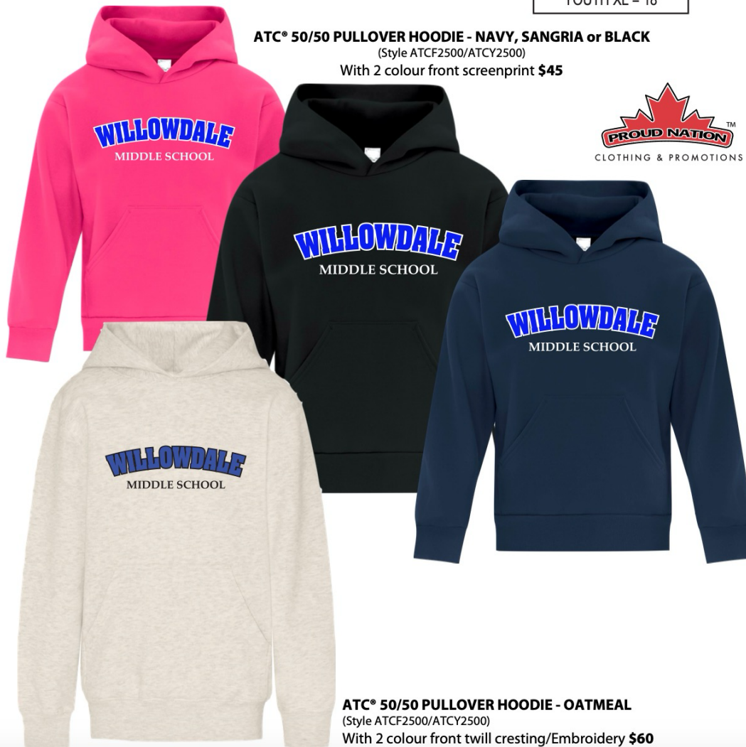
ATC® 50/50 PULLOVER HOODIE - NAVY, SANGRIA or BLACK

YOUTH SMALL = 6/8 YOUTH MED = 10/12 YOUTH LARGE = 14/16 YOUTH XL = 18