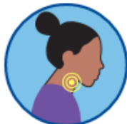
Sore throat, painful swallowing