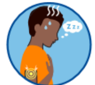
Feeling unwell, muscle aches, feeling tired