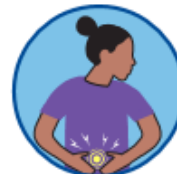
Nausea, vomiting, diarrhea