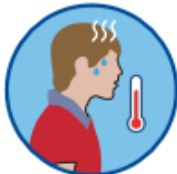
Fever > 37.8°C