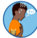
Not feeling well, tired or sore muscles