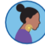
Sore throat, trouble swallowing