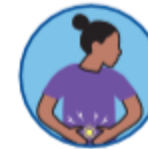
Nausea, vomiting, diarrhea