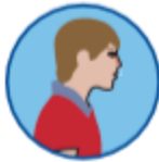
Runny nose or red eyes